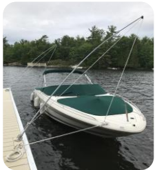
Premium Mooring Whips