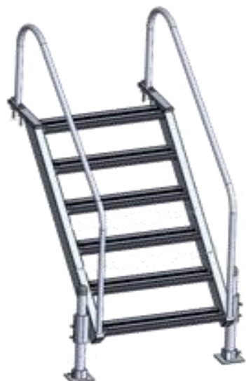
Water Entry Staircase