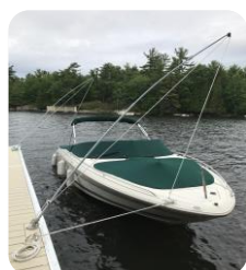
Premium Mooring Whips